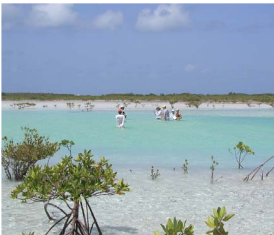
In tidal channel of Shroud Cay

For the complete program visit: http://www.cslnmiami.info/learning/fieldSeminars